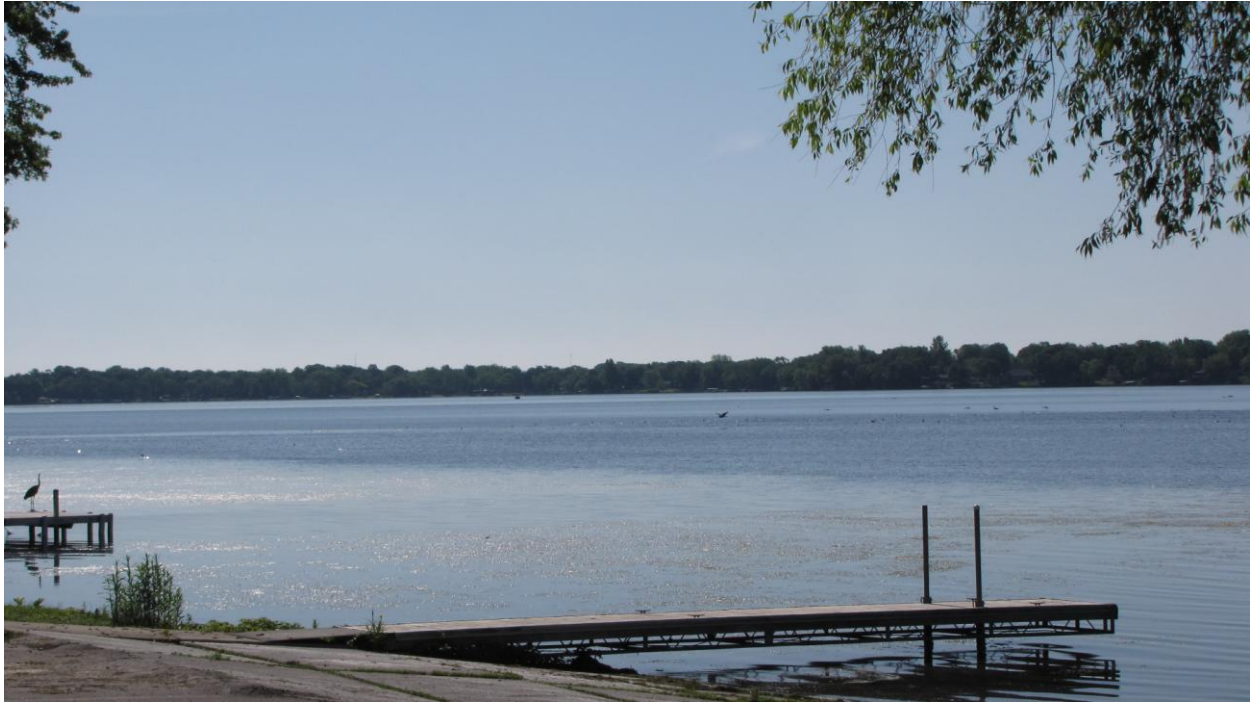
Figure 4. A picture of Lake Roberds along the DNR boat access. Curly-leaf pondweed has reached the surface and now occupies most of the shoreline along the lake.